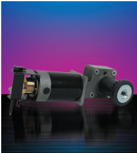
Stairlift DC gearmotor.