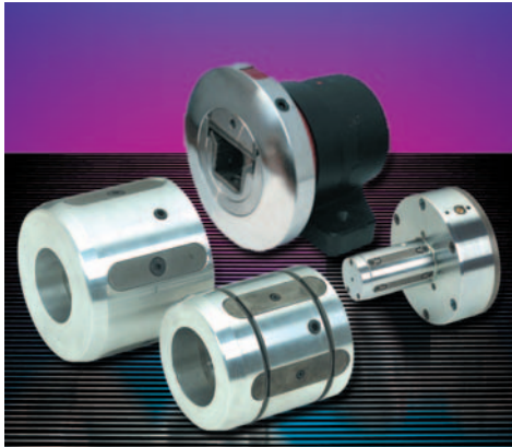
DK40 Safety chuck with 6" mechanical expanding core chuck.