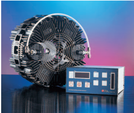
Re Spa CX 250 combiflex brake with MW90.10 microprocessor control.